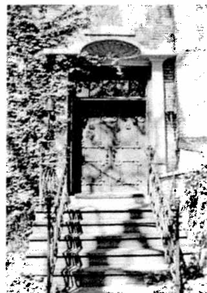
The most significant exterior alterations to houses in the Fremont Row House District involve porches. Examples of changes include (top left) the side-angled stairs at 2128, (top right) the Eastlake-style porch at 2138, (middle left and right) the Classical-style porches at 2118 and 2126, the Regency-style "pent" roof at 2100, and the Classical-style "scallop" detailed railings at 2124.